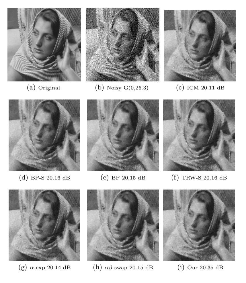
Fig. 3. The image restoration results for truncated \ell_1 - \ell_2 prior with threshold T = 50, \ell_2 data fidelity term, and \lambda = 2